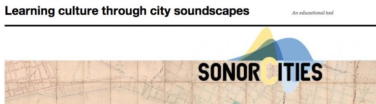
Figure 1. Logo and entry page of the project. Source: sound-cities.turkmas.uoa.gr/

But SonorCities succeeds in becoming much more than its educational components. Through a creative combination of theoretical discussion, guided fieldwork, and dynamic digital representations of the urban soundscapes, SonorCities asserts itself as an alternative methodological route to an interdisciplinary study of the sound culture of the past as well as a research-driven and community-oriented Digital Humanities project.