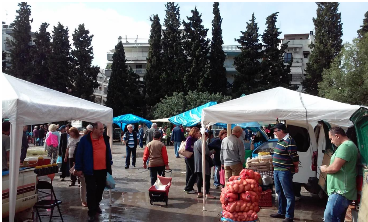
Anti-middlemen market, Thessaloniki, 11 October, 2015.

recent shift in the positions of SYRIZA (the main contingent in the government since the elections held in January and, again, in September 2015) towards austerity. This shift seems to imply a turn from outright animosity towards austerity (an animosity that almost constituted a politically ontological differentiation from the pro-austerity parties), to an ambiguous embracement of positions that resemble tenets of liberal pragmatism. The new position attributed to SYRIZA towards austerity has serious repercussions on the solidarity economy, especially on its dialectical stake between the grassroots movement and the state.