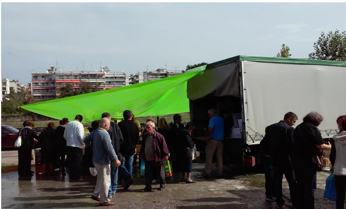
Anti-middlemen market, Thessaloniki, 11 October, 2015.

Solidarity was defined in quite clear formations by my research participants at the time, as a form of “mobilizing others” (Rakopoulos 2015) and, as I discussed in a recent JMGS article, in terms of a strict antithesis to austerity (Rakopoulos 2014b). Some of this tendency developed in a movement upheld by the Left coalition party SYRIZA (among other players) and instigated a partial institutionalization of the social mobilization around food. Following and echoing this, the idea of solidarity started transforming from a politically loaded discursive feature of political education to one that cross-fertilized with other, similar ideas (from charity to networking to comradeship). Discussions (and fears) of cooptation were rampant among many research participants throughout this course of events, along with a (still present) discussion of “conferring” movemental impetus to the institutional Left which was expressed in participants’ waiting for a Left government’s friendly embrace while conferring some of their enthusiasm to that prospect. In some occasions, this expectation and enthusiasm eventually translated into a yearning towards institutional change rather than towards grassroots relief, and, to an extent, in the process pushed the movement to work in that direction. The idea is often discussed in Greek movement circles as anathesi (ἀνάθεση) or he logiki tis anathesis - the logic of conferring.