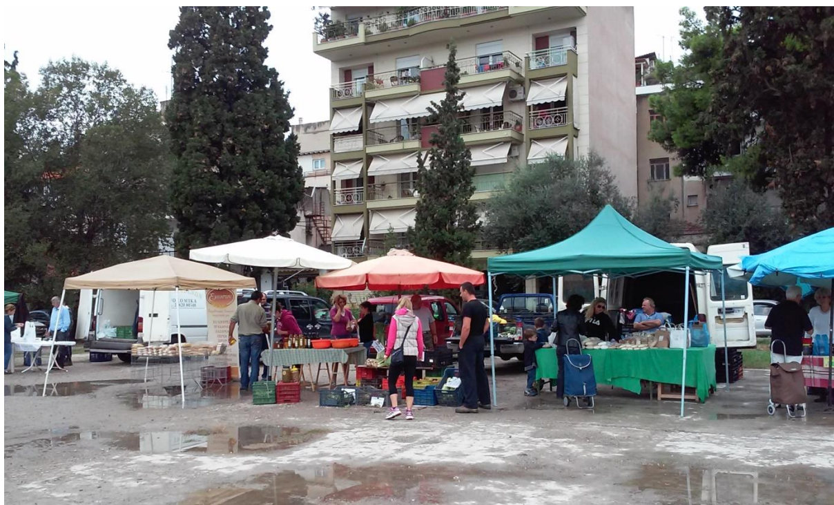
Anti-middlemen market, Thessaloniki, 11 October, 2015.